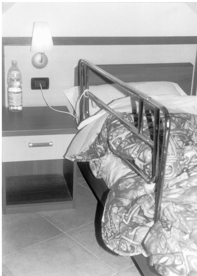
FIGURE 1. The bed bars fitted at the sides of the bed.

The patient was affected by Alzheimer’s disease, and about 3 months before, she had suffered an epileptic crisis. External examination showed minute abrasions of the external angle of