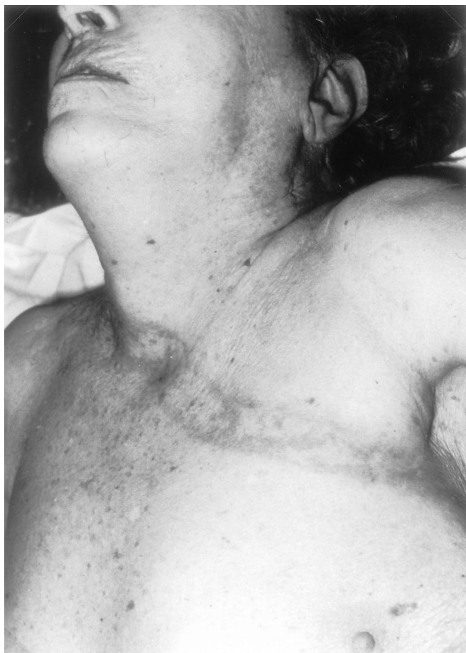
FIGURE 7. The skin lesion produced by compression of the neck by the bed bar.

when they were pressed. Histology showed only diffuse alveolar rupture (indicating acute pulmonary emphysema).