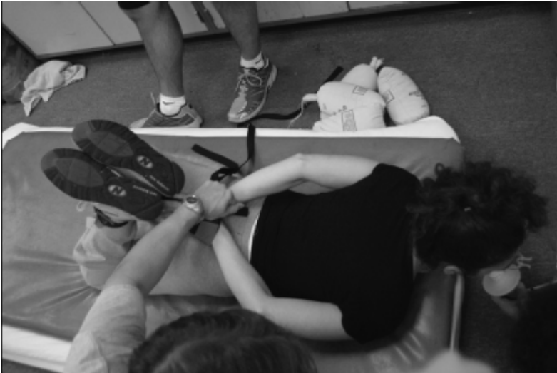
FIG. 1—Illustration of a subject in the prone maximal restraint position (PMRP)

HOWEVER! No amount of “argument” can successfully excuse or justify the FACT THAT: Chan et al conspicuously neglected to identify the entirely NON-“theoretical” study limitation produced when they stacked a gymnastic mat ON TOP OF a THICK MATTRESS , in order to create the surface their study subjects were placed on during performance of their so-called “Cardiopulmonary Measurements During Maximal Struggle!”